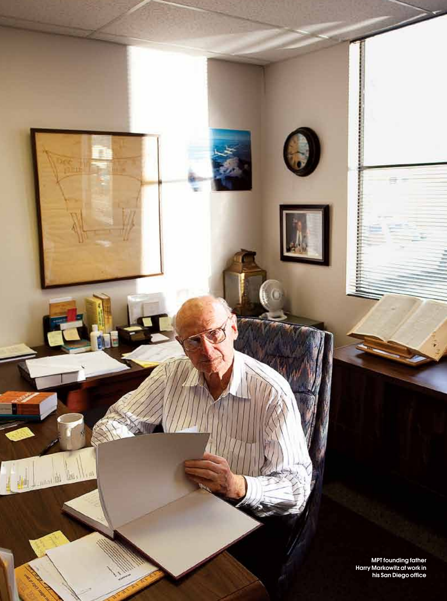
MPT founding father Harry Markowitz at work in his San Diego office